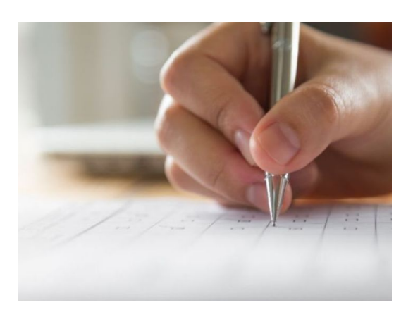
April 2021 - October 2021: Outcome Evaluation Study: Knowledge Change

The Cornell Social Media Lab is always looking for ways to improve Social Media TestDrive! Some of the efforts in this direction include a beta version of Social Media TestDrive enhanced with teacher and learner dashboards that we have developed for tracking individual and classroom learning progress. You can test these features by participating in a research study to evaluate the effectiveness of Social Media TestDrive. In addition to having access to the dashboards, participating classrooms will also receive a small compensation for their time and help: $75 Amazon eGift Card!